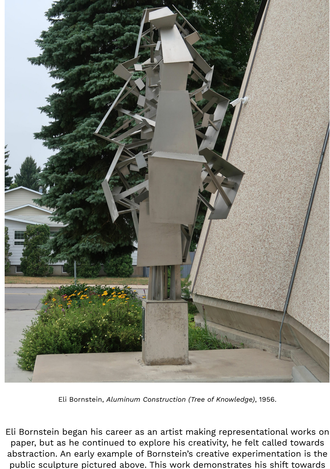
boundaries when capturing their ideas artistically.

Explore a Learning Activity from our Eli Bornstein Teacher Resource Guide entitled "Experimenting with Structures."