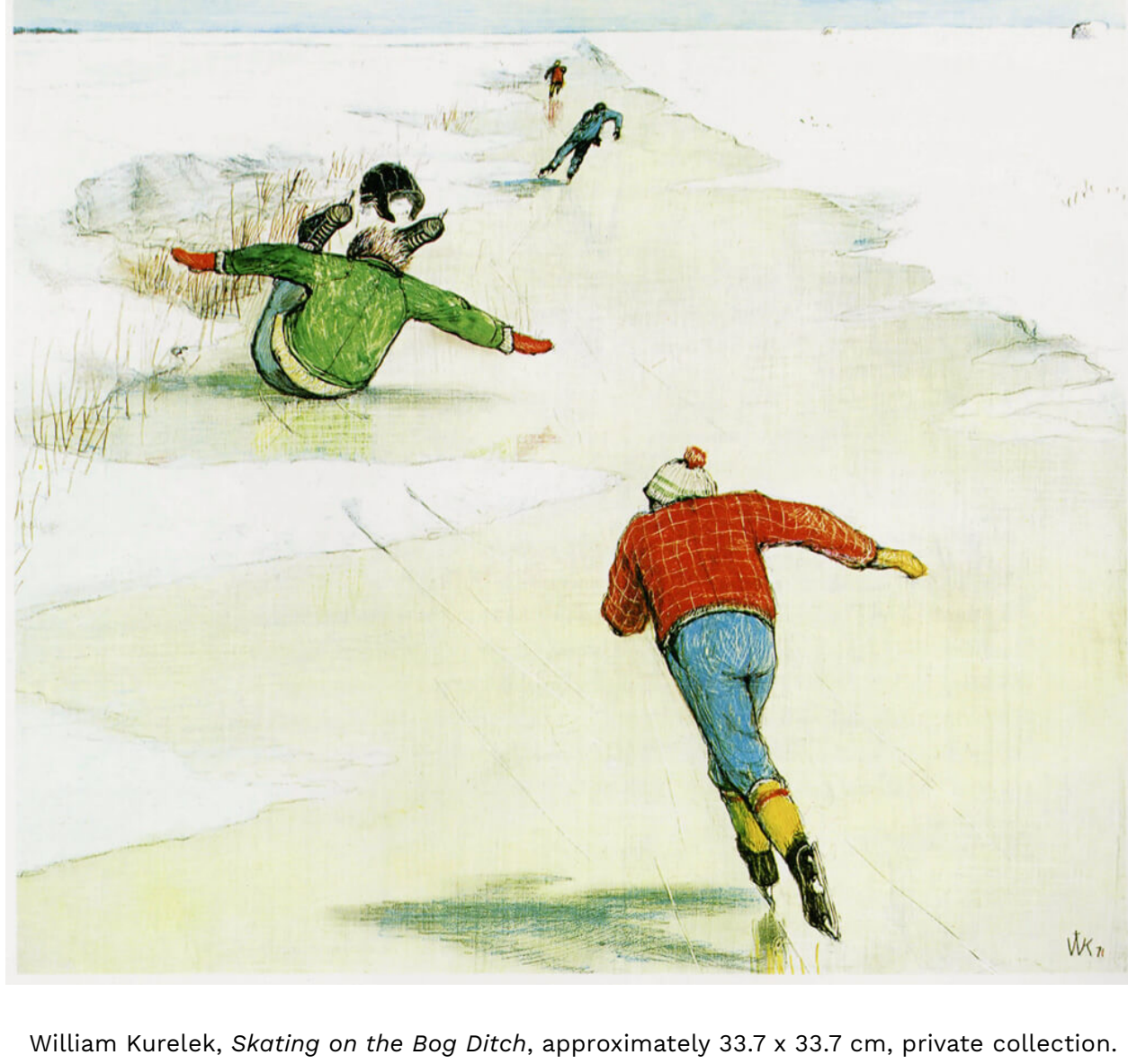
William Kurelek, Skating on the Bog Ditch , approximately 33.7 x 33.7 cm, private collection.

In our final newsletter of the year, we're wishing educators a safe and happy holiday season and presenting the materials for our 2025 Student Challenge!